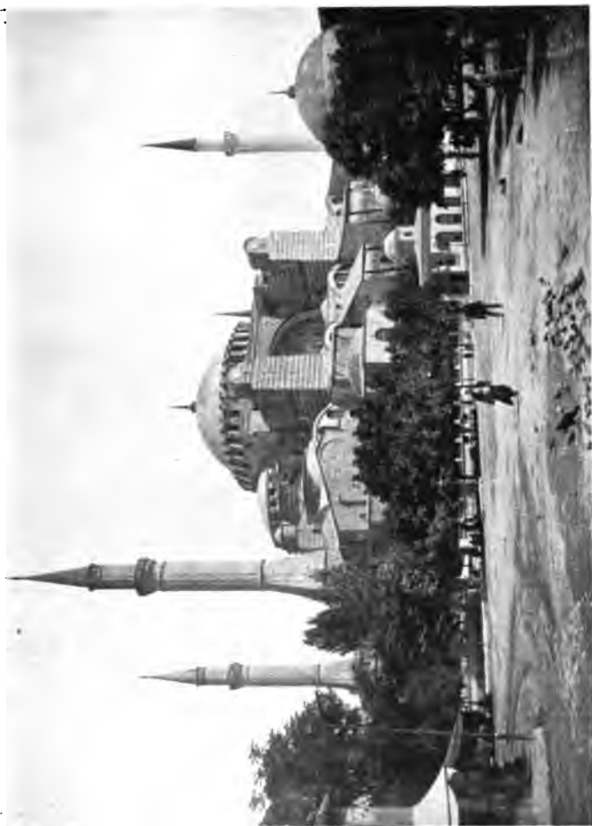
THE SPLENDOR OF SAN SOPHIA